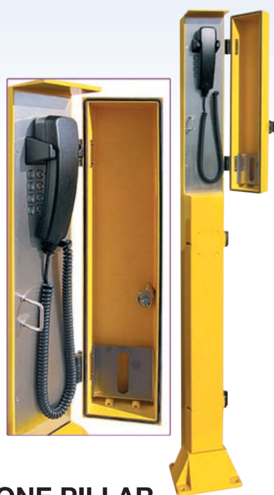
PHONE PILLAR TELEPHONE-INTERCOM