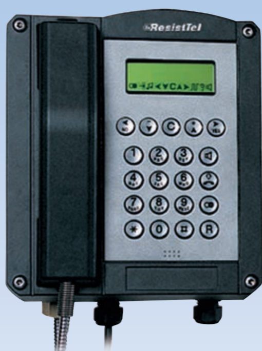
WEATHERPROOF TELEPHONE TELEPHONE RESISTANT A L'EAU ET A LA POUSSIERE