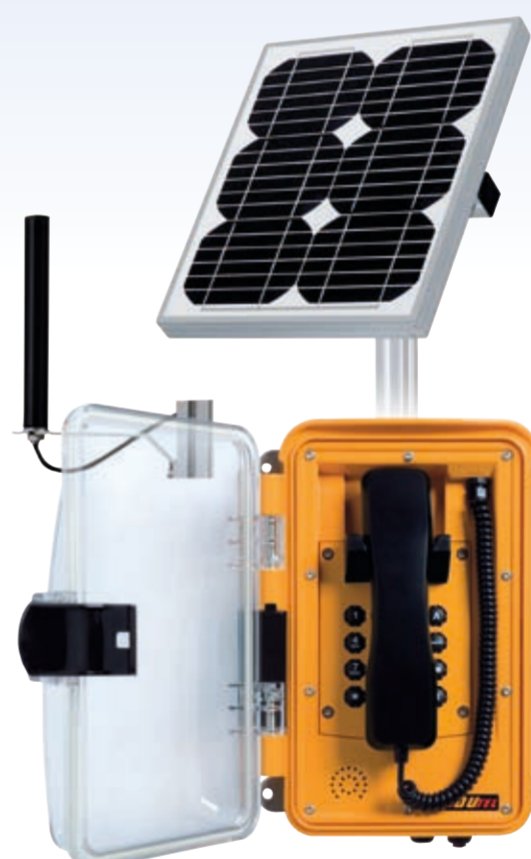
IP66 WEATHER- PROOF GSM POWERED BY SOLAR PANEL GSM POUR PLACEMENT A L'EXTERIEUR (IP66) ALIMENTE PAR PANNEAU SOLAIRE