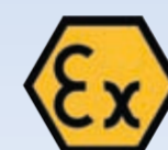
EX-PROOF TELEPHONE VoIP TELEPHONE VoIP ANTI DEFLAGRANT